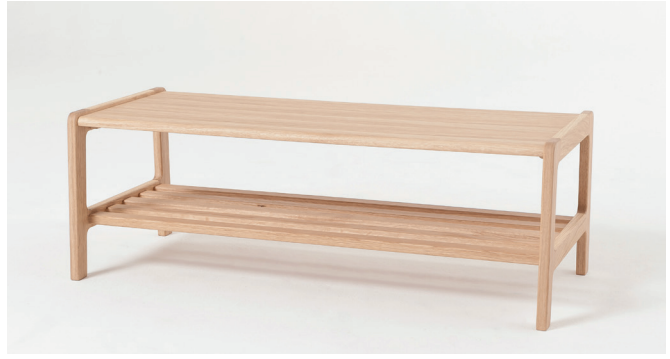
Agnes Kay + Stemmer

Agnes is a popular collection of designs made from solid oak or walnut, with veneered shelves. Each piece in the collection comes out of the box as solid one piece items, with no assembly required. The design has the hallmarks of classical furniture-making training; details include radius edges, a gentle upwards taper and perfect proportion. The collection is comprised of high and long shelving units, a side and coffee table, console table and a mirror.