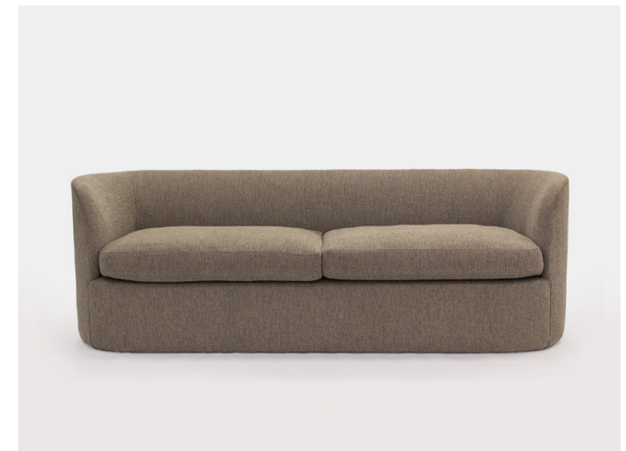
Clapton two seat sofa